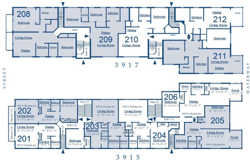
LEVEL 2 RESIDENCE FLOOR PLANS

Each Condominium unit shall have as its boundary the interior unfinished surfaces at the ceiling, floor and perimeter walls. Unit area is calculated from center line of party walls and exterior of perimeter walls. All bearing walls located within a condominium unit constitute a part of the common elements up to the unfinished surfaces of said walls. Area between unit boundary and calculated area shall be L.C.E. to the adjoining unit. (Common Element = C.E. and Limited Common Element = L.C.E.) All lands and all portions of the Condominium Building or other improvements, not located within the confines of a Condominium unit are property of the C.E. or L.C.E. as indicated within the graphics or floor plans. All dimensions shown are based upon field measurement and may vary slightly from unit to unit. Common Elements (C.E.) means the portion of the Condominium property not located in the Condominium unit, but shall include chases through each unit for electrical conduits, plumbing pipes, duct, telephone lines and other facilities for the furnishings of utility services to each unit. All improvements shown are existing.