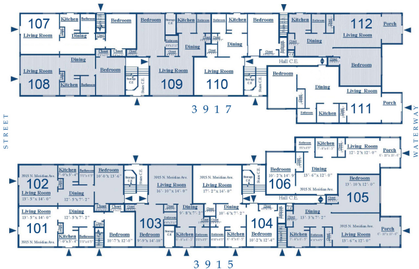
LEVEL 1 RESIDENCE FLOOR PLANS